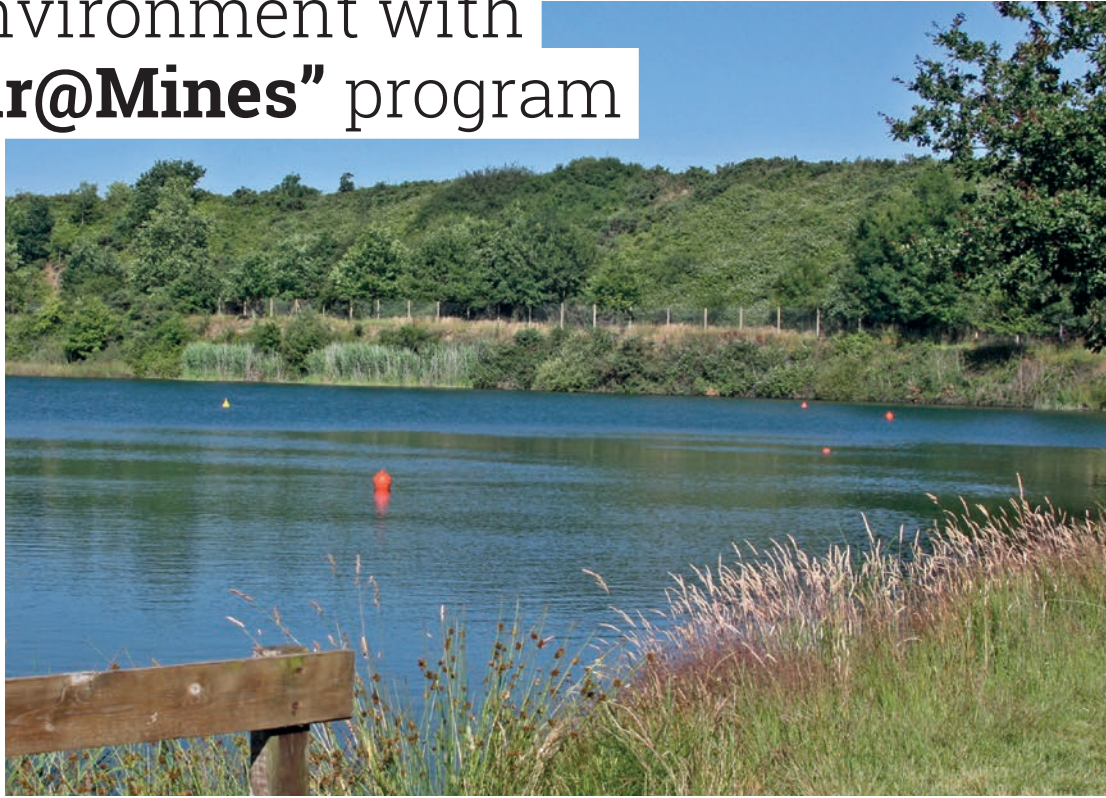
Remediated site of Escapière (Vendée, France)

Our teams are currently working in the following fields under the “ Envir@Mines ” R&D program: